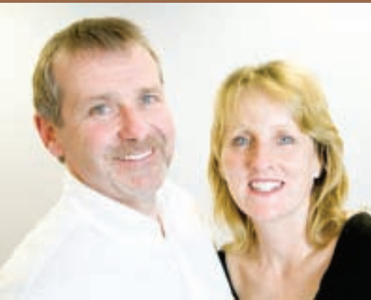
The dentists behind your new smile